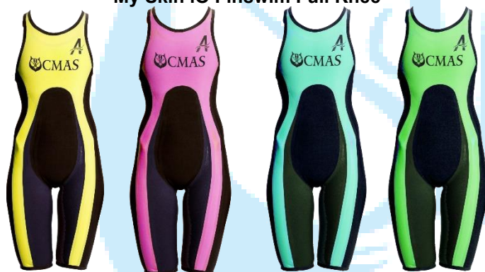
My Skin iO Finswim Full Knee