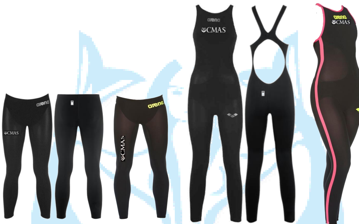
Woman Full Body open back