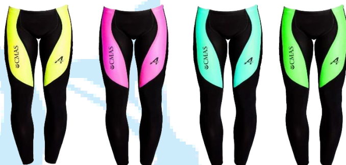
My Skin iO Finswim pants