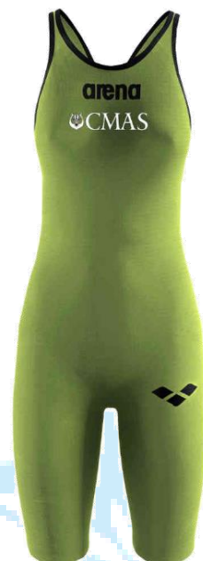
- Carbon PRO Closed back - Carbon PRO Open back